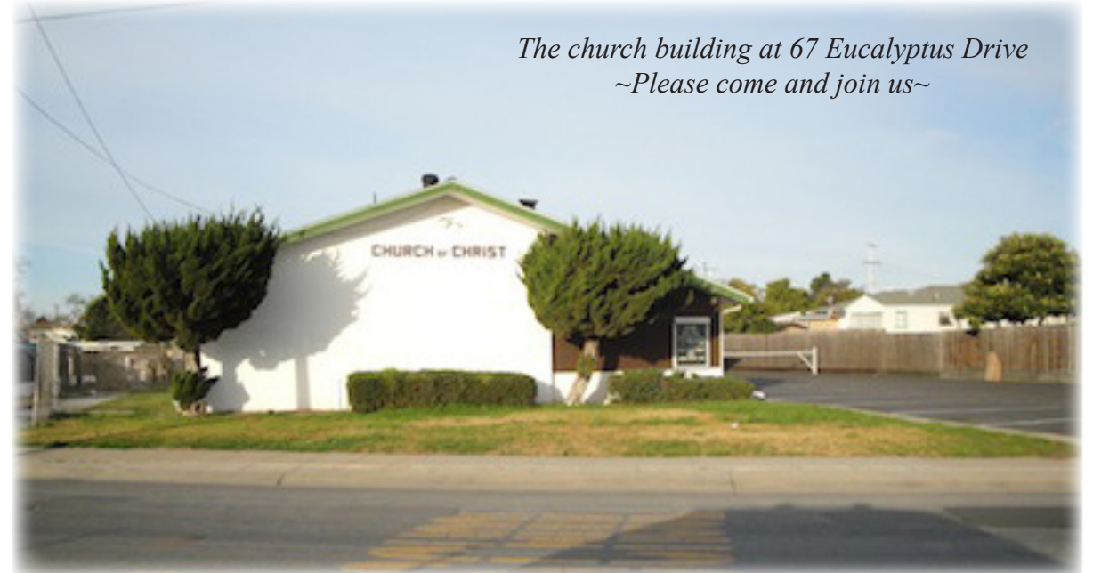
The church building at 67 Eucalyptus Drive ~Please come and join us~

67 Eucalyptus Drive Salinas, California 93905-2728 (831) 424-9800 or 726-1319 Paul McCollum, preacher pulpitpaul@razzolink.com